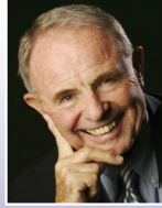
Fisher DeBerry Coaching Legend