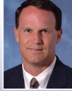
Troy Calhoun Air Force