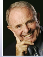
Fisher DeBerry Coaching Legend