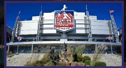
MILE HIGH STADIUM

Enjoy a memorable evening in the perfect football setting with Colorado's top college coaches. The event will raise money for charitable organizations throughout the state and will feature food, drinks, words from all of the coaches and a highlight video, as well as a live and silent auction.